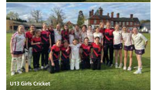
U13 Girls Cricket