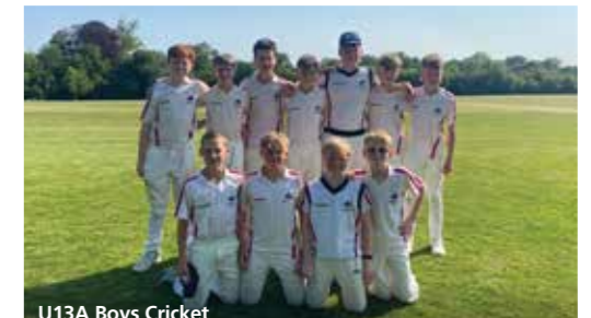
U13A Boys Cricket

The sun also shone on our sports days this year. Our Pre-Prep pupils proudly showed their spectators all of the skills that they have developed over the year and Prep school sports day saw a superb balance of competition and sportsmanship throughout. The commitment of all pupils was a wonder to see, with records being broken across all ages and Livingstone coming out as overall winners this time around.